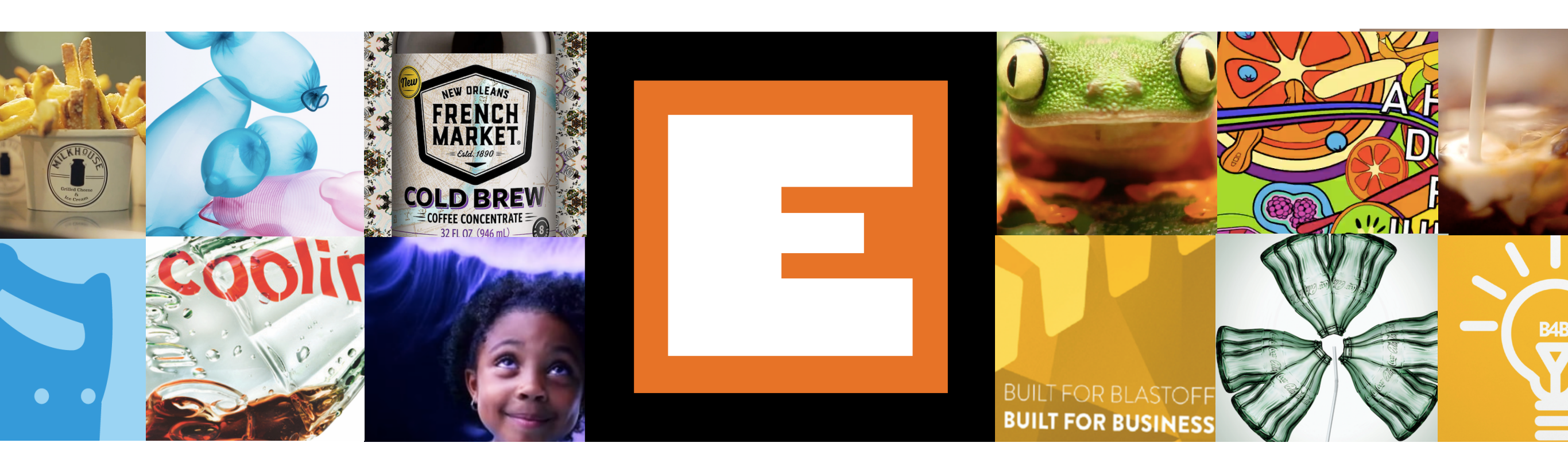
eddie snyder works